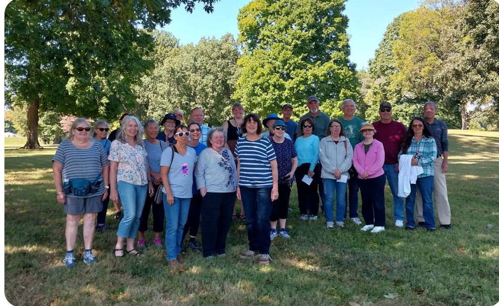
Empowered Minds Great Circle Earthworks Tour

Answer burning anime-related questions while consuming hot food. Completing the task might be easier said than done.