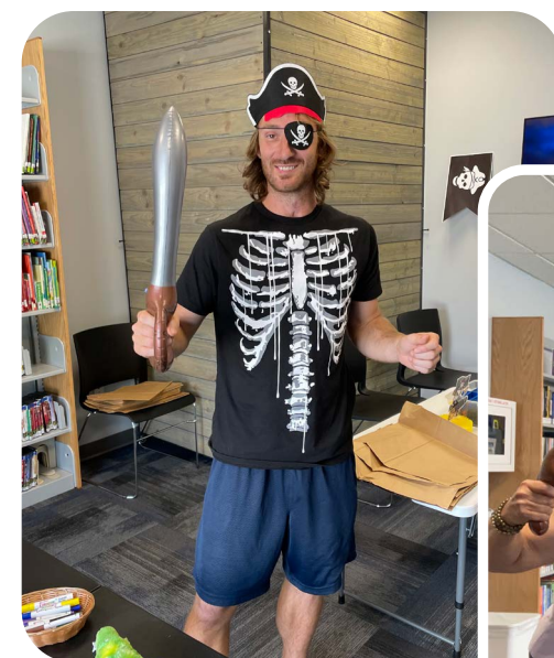
Talk Like a Pirate Day at Utica

Do you want your brown house to really sparkle with holiday magic? Luckily, we have someone to teach you inside tips on basic gingerbread house structure as well as incredible decorating details.